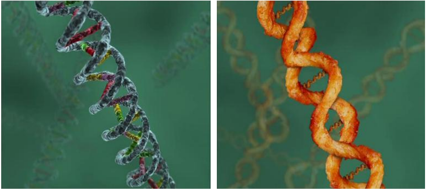
FIGURE 2 Metaphorical transformation. Left picture: a standard illustration of DNA.